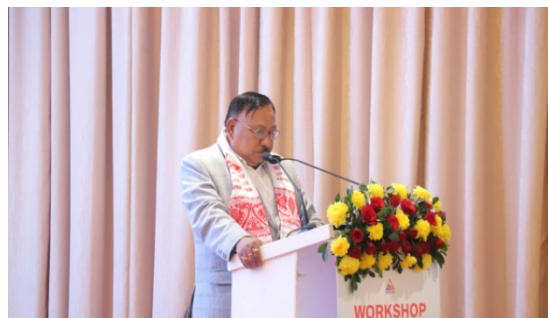
Sh. Jogen Mohan, Hon'ble Minister of Revenue & DM Department, Govt. of Assam

Shri Jogen Mohan, Hon'ble Minister of Revenue & DM department, Govt of Assam in his address mentioned that workshop will provide an opportunity for the participants to share their experiences like issues being faced in implementation of the scheme, best practices, lesson learnt and success stories. He also emphasized that community play as first responder in case of disaster before the Govt. machinery and support reaches. So it is imperative to