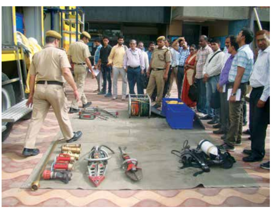
On Display: Participants being introduced to equipment used in handling CBRN emergencies

Chemical, Biological, Radiological, Nuclear (CBRN) terrorism has become a reality and we need to be prepared for the same. Each facet of CBRN has different characteristics and thus, different response mechanisms are needed to handle them. Adverse impacts of CBRN disasters can be minimized with comprehensive planning, preparedness and a prompt and effective emergency response.