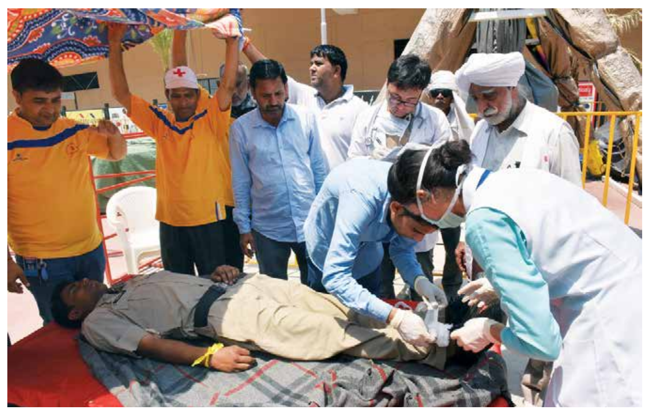
Administering First Aid: Healthcare professionals attending to the injured during the mock exercise

NDMA has conducted more than 500 mock exercises on various disasters throughout the country to improve preparedness and response mechanisms.