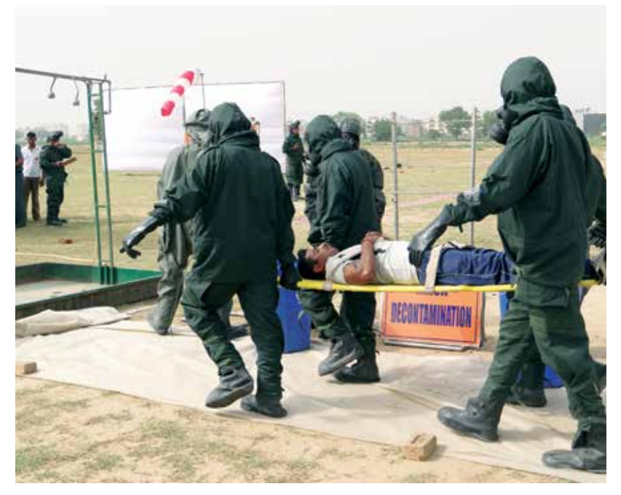
Trained NDRF personnel demonstrating the response mechanism during a CBRN mock drill

Course Coordinator, highlighted the importance of combining technology and training to counter emergencies. He emphasized on the importance of hands-on training on medical preparedness for security personnel to help them deal with any CBRN eventuality.