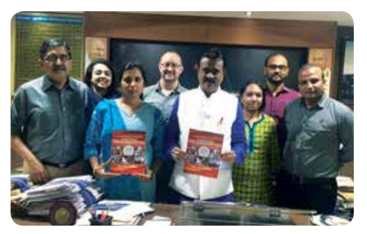
Showcasing the Ahmedabad HAP

Ahmedabad's Heat Action Plan is an example of how better preparedness can help in mitigating the effects of a heat wave. With the Indian Meteorological Department now providing a five-day heat forecast during summers, similar Heat Action Plans may be developed for other cities across the country. It will go a long way in saving thousands of lives. \Box