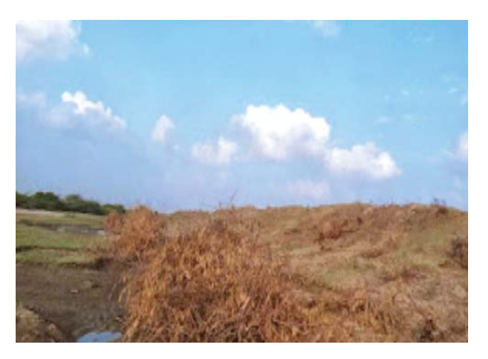
Kona Saline Embankment, Krishna District

4.5 Odisha : Out of a total of 154 MPCS, 153 MPCS have been completed; out of 218 Kms. roads, 211 Kms have been completed and 57.77 Kms. saline embankments have been completed.