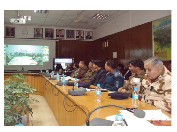
Figure 2 Table Top Exercise