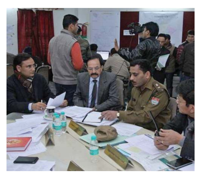
Figure 4 EOC Planning Phase

6.5 A number of observers are also detailed to monitor the exercise. Apart from the participants, community members and other stakeholders are also invited to attend the mock exercise. Afterwards, a detailed debriefing is carried out in which the