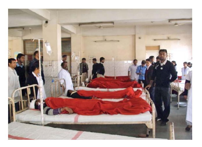
Figure 8 Hospital Surge Capacity