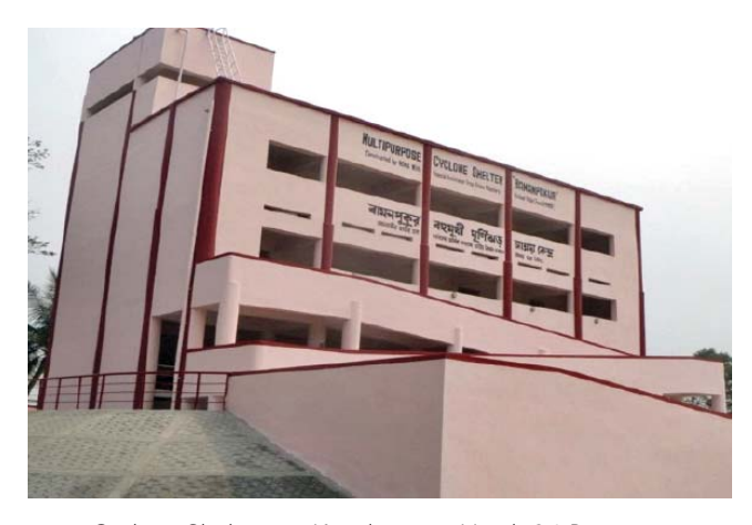
Cyclone Shelters at Kaushangra, North 24 Parganas District under PMNRF

EPIL plans to complete the construction of the remaining seven shelters in 2017.