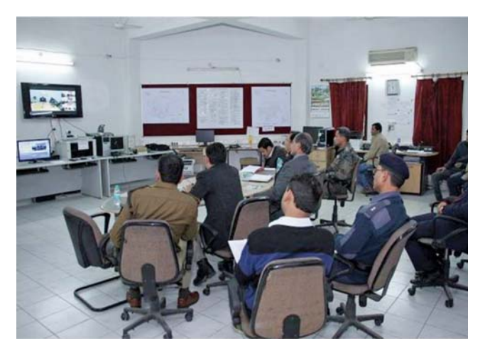
Figure 9 & 10 Hot wash and debriefing session with State officials and on video conference with district HQs