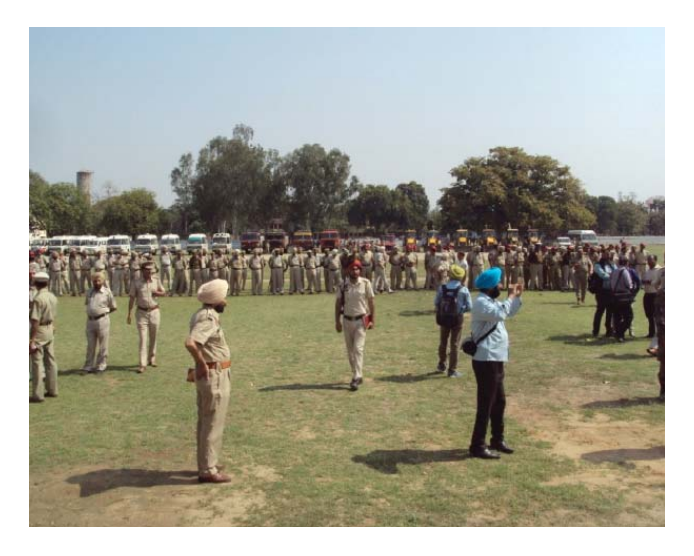
Figure 5 Staging Area