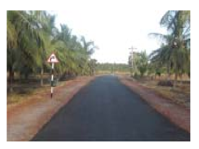
Connecting Road, Vishakhapatnam District