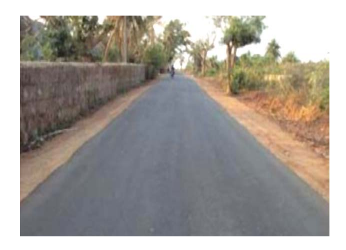
Connecting BT Road