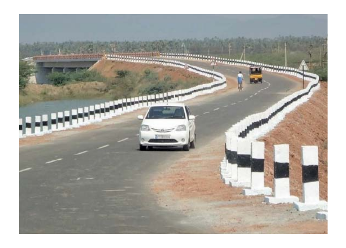
Bridge, East Godavari District