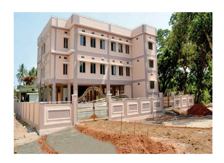
MPCS, East Godavari District

Photographs of Assets created under NCRMP Phase-I (Andhra Pradesh)