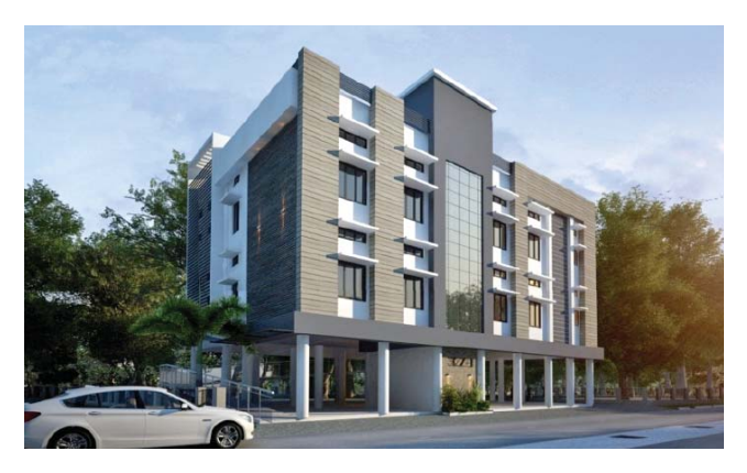
Bird's eye view of proposed multipurpose Evacuation cum Community Centre at Minicoy Island of Lakshadweep

and UT Admn. of Lakshadweep has been signed. To assess the technical adequacy of design and drawing of the shelter, a meeting of the Technical Advisory Committee (TAC) with experts drawn from IIT-Kharagpur and Structural Engineering Research Centre (SERC), Chennai, was held on 17.08.2016. The final design, vetted by a third party, has been accepted by TAC members and the approval has been communicated by NDMA to Lakshadweep Administration. CPWD has requested for revising the estimates for an amount of Rs.3,36,99,200/-. The justification for the same, however, is awaited. The project has a timeline of 24 months i.e. 17.07.2018.