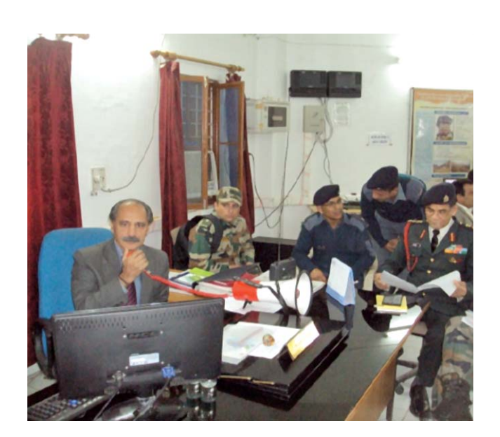
Figure 3 EOC Observers

before the actual mock exercise. The exercise is conducted on a simulated scenario. Incident Response System (IRS) is used as a response mechanism- EOCs are activated, Staging areas and Incident Command posts are established, wireless and Satellite phones are used in case of communication breakdown and composite Task Forces are created to respond as per requirement. These exercises enhance the ability to respond faster, better and in an organized manner during the response and recovery phase.