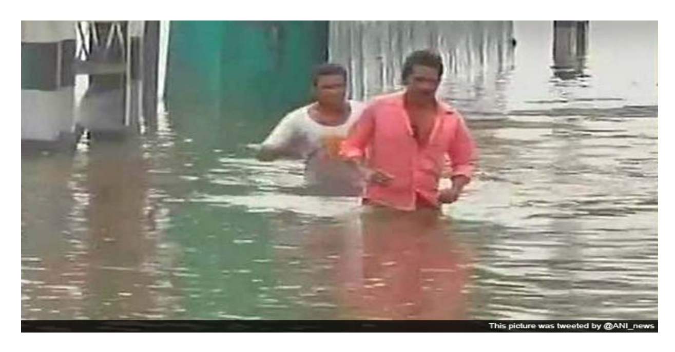
Fig. 2: Floods after Hudhud.