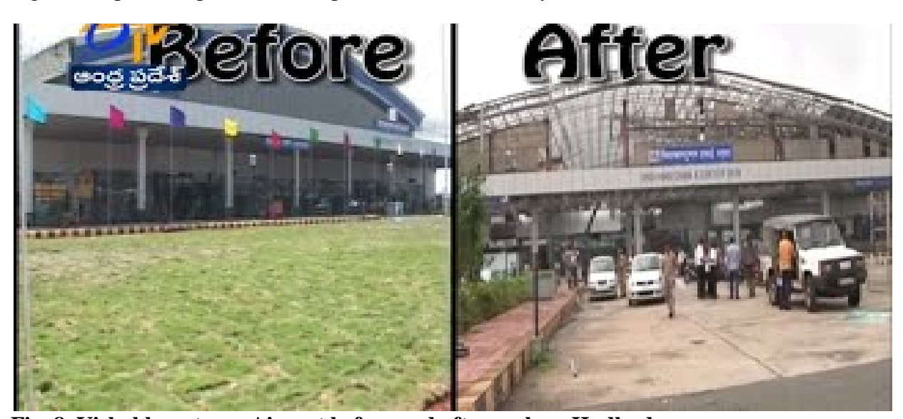
Fig. 8. Vishakhapatnam Airport before and after cyclone Hudhud.