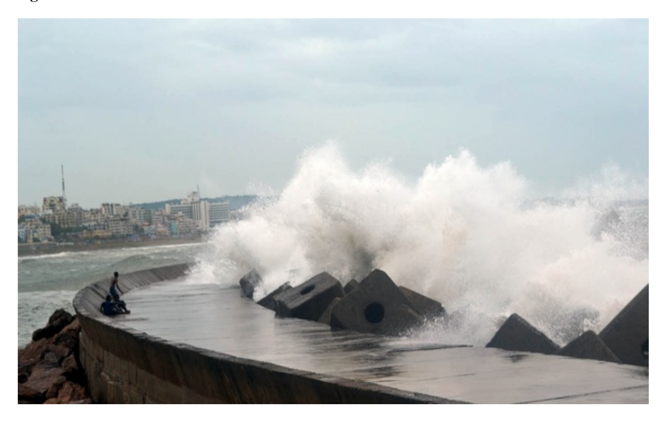
Fig. 3: Strom surge during Hudhud.

1.5. The Cyclone Hudhud caused extensive devastation in the affected districts, wherein large number of trees were uprooted, roads and buildings were severely damaged, and power and telecommunication infrastructure was disrupted.