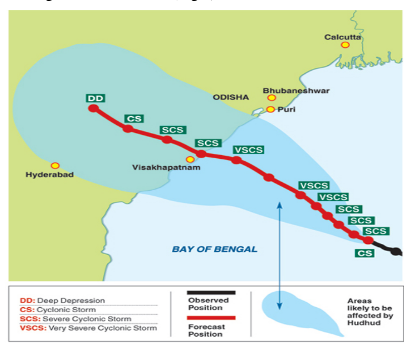
Fig 1: Path of Cyclone Hudhud.

It crossed north Andhra Pradesh coast over Visakhapatnam (VSK) between 1200 and 1300 HRS IST on 12th Oct. 2014 with the same wind speed. After landfall, it continued to move northwestwards for some time and weakened gradually into SCS in the evening and further into a CS by midnight. It then, weakened further into a Deep Depression (DD) in the early morning of 13<sup>th</sup> Oct. 2014 and into a depression in the evening of 13<sup>th</sup> Oct. 2014. Thereafter, it moved northwards and weakened into a well-marked low pressure area over East Uttar Pradesh and neighborhood in evening of 14th Oct. 2014 (Fig 1).