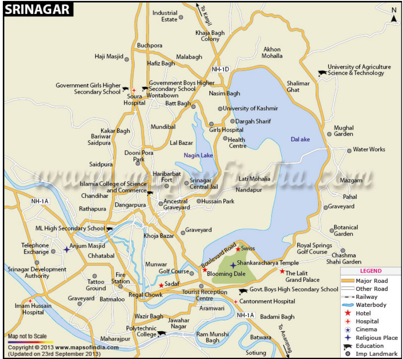
MAP OF DISTRICT SRINAGAR